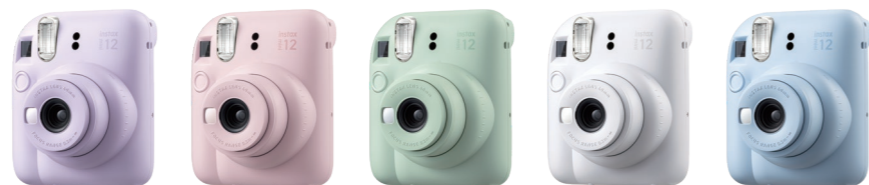
LILAC PURPLE BLOSSOM PINK MINT GREEN CLAY WHITE PASTEL BLUE